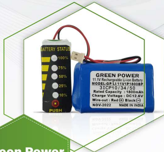
Green Power Smart Battery with Fuel Gauge